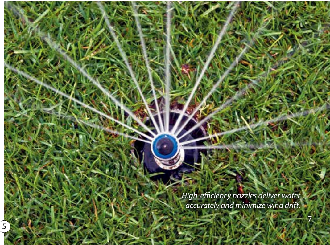
High-efficiency nozzles deliver water accurately and minimize wind drift.