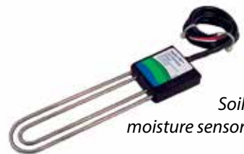
Soil moisture sensor