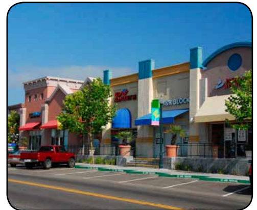
Well managed landscapes can save you water and money.