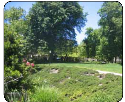
Well managed landscapes can save you water and money.