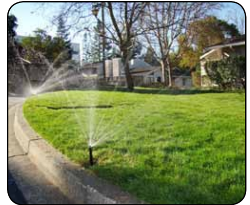
New high efficiency sprinklers and rotating nozzles