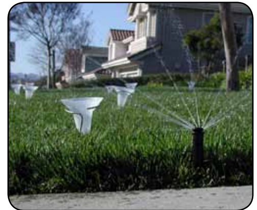
Irrigated Area: 18+ estimated acres of irrigated area.