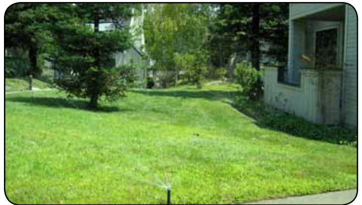
New sprinklers and rotating nozzles installed to improve irrigation efficiency and help to reduce irrigation run off.