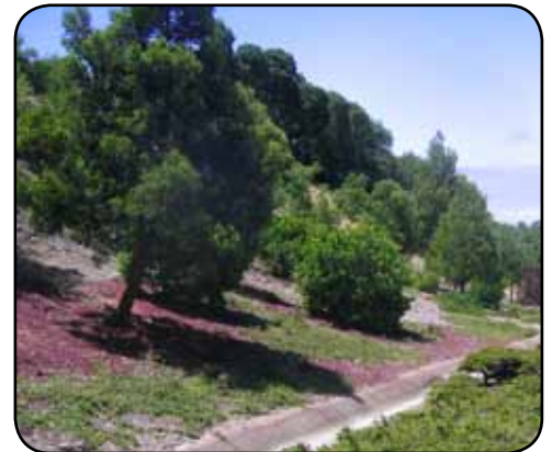
Well managed landscapes can save you water and money.