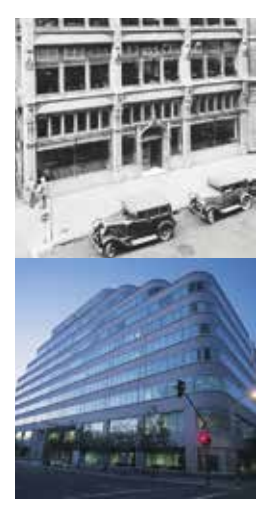
Then and now: Headquarters in Oakland

For more information visit: www.ebmud.com Send an email to RatesandBudget@ebmud.com 1-866-403-2683