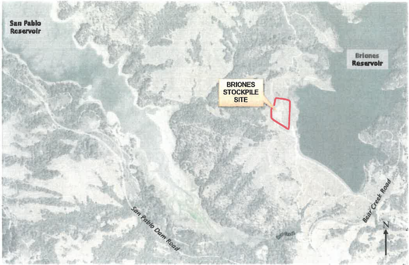
Figure 2 Briones Stockpile Site