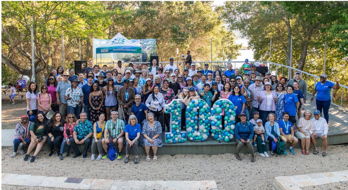
Above: EBMUD's diversity on display at the Centennial picnic at Lafayette Reservoir in 2023, celebrating 100 years of service.

Our core values – Stewardship, Integrity, Respect, and Teamwork – guide us in fostering an environment where every employee is valued, every vendor is treated equitably, and every customer receives excellent service.