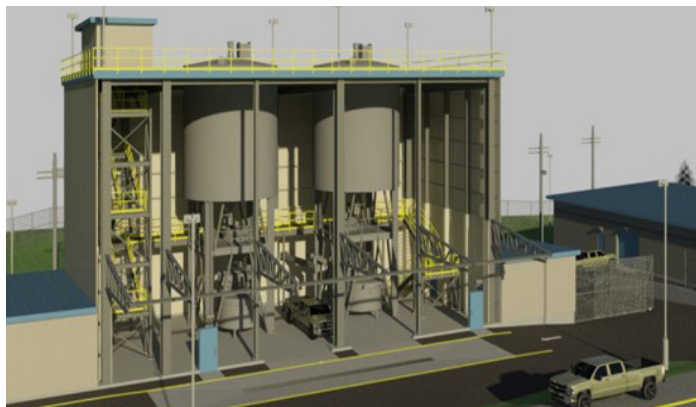
Rendering of future Pardee Chemical Plant Facility.

As a result of the Project's scope, multiple trades and types of work are required. They include but are not limited to: civil site work and utilities; structural (concrete, pre-engineered metal buildings), process mechanical and building mechanical, electrical (medium and low voltage), instrumentation, and system integration. Bidders must hold an active Class A license.