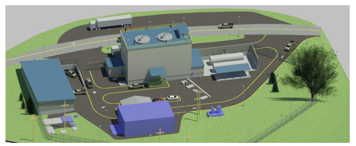
Top: Redwood building and lime building to be demolished. Bottom: Rendering of future Pardee Chemical Plant Facilities.

The East Bay Municipal Utility District (District) is inviting bids for the Pardee Chemical Plant Improvements project (Project), anticipated to advertise in September 2025. The bulk of the work will take place at the District's Pardee Chemical Plant (Chemical Plant), located in Valley Springs, California, with a small amount of work to be performed at nearby Camp Pardee.