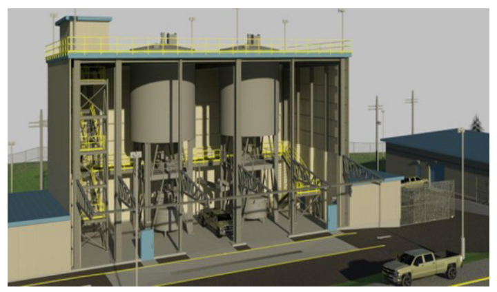
Rendering of future Pardee Chemical Plant Facility.

As a result of the Project's scope, multiple trades and types of work are required. They include but are not limited to: civil site work and utilities; structural (concrete, pre-engineered metal buildings), process mechanical and building mechanical, electrical (medium and low voltage), instrumentation, and system integration. Bidders must hold an active Class A license.