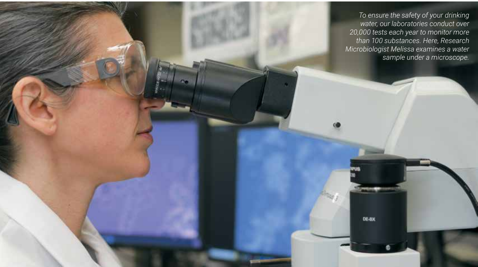
To ensure the safety of your drinking water, our laboratories conduct over 20,000 tests each year to monitor more than 100 substances. Here, Research Microbiologist Melissa examines a water sample under a microscope.

Learn more about emergency water storage and other ways to prepare at www.ebmud.com/emergency-preparedness .