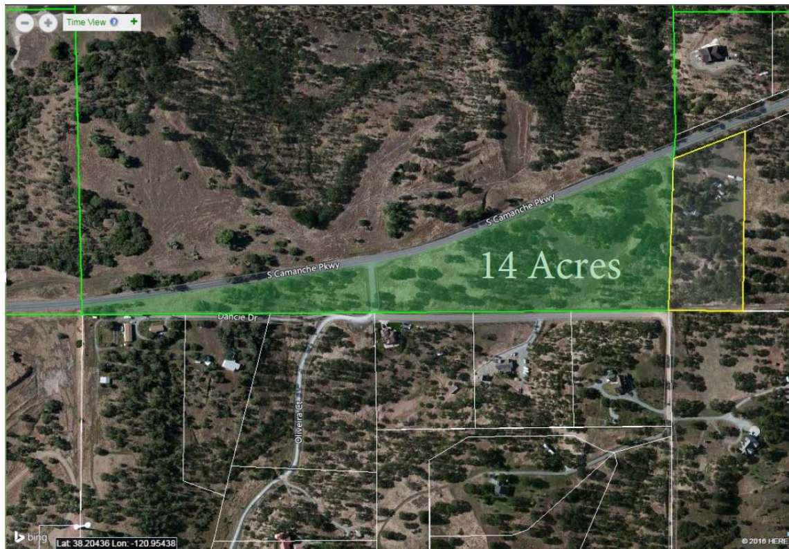
Table 2- APN 048-001-003 Zoning and Land Use Designation