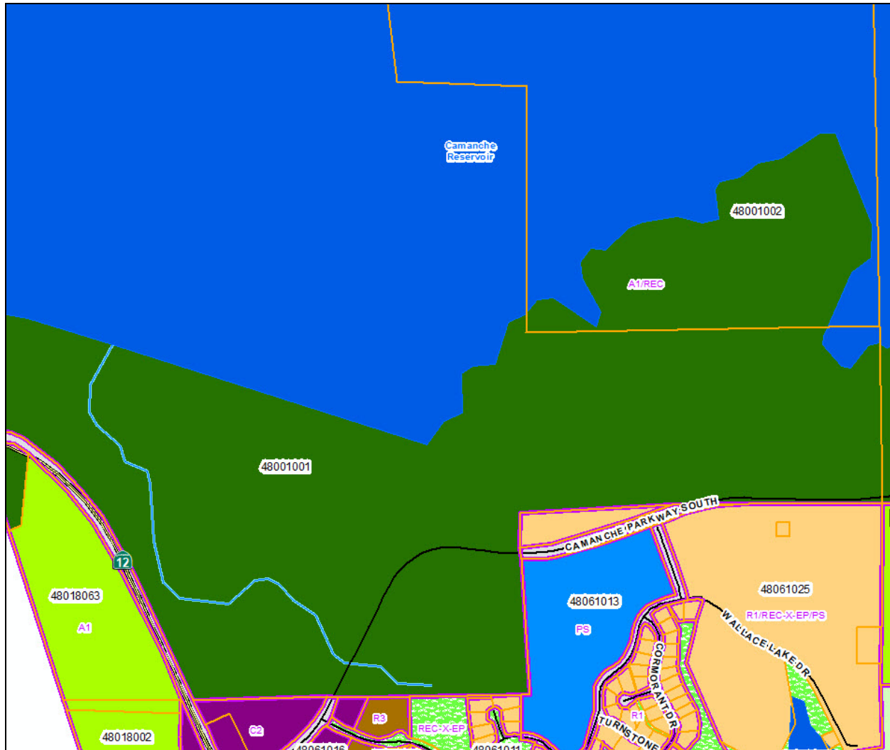
Land Use Designation and Zoning Classification of APN 048-001-001