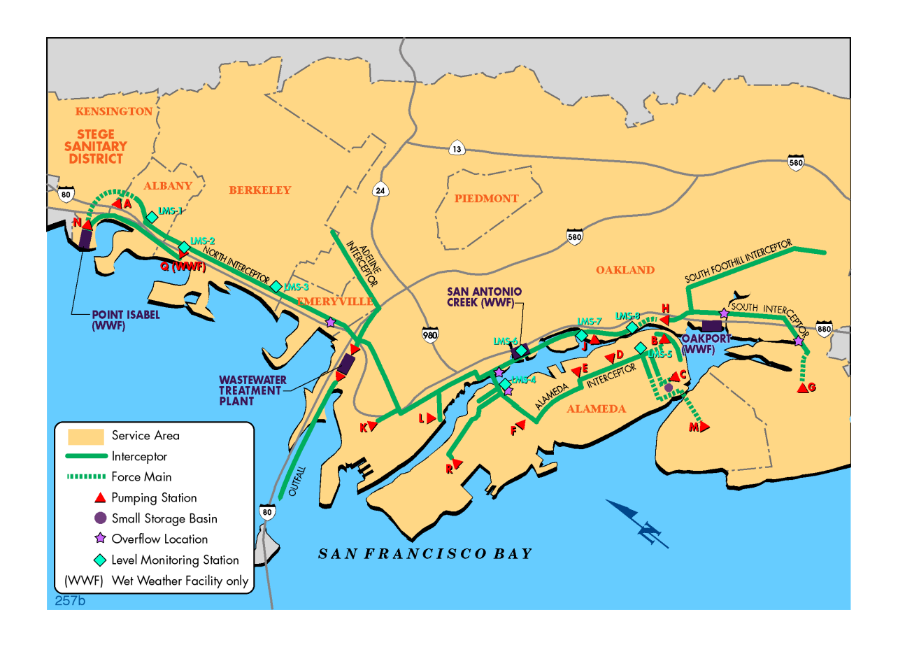
Figure 1.1 - EBMUD Wastewater Service Area