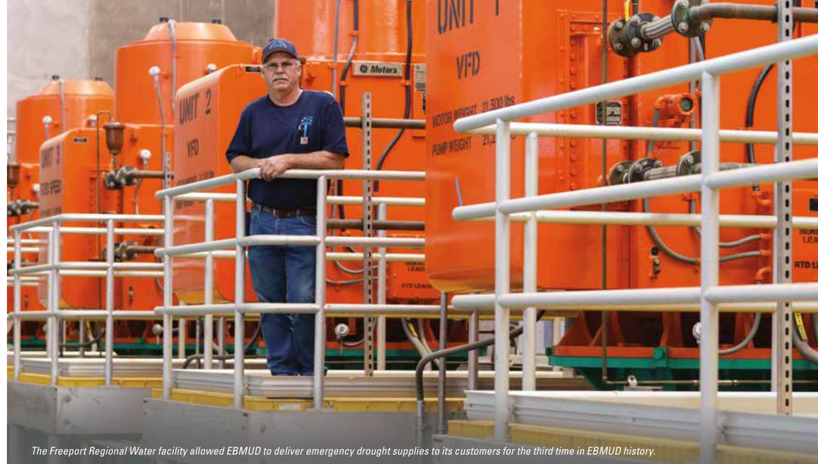
The Freeport Regional Water facility allowed EBMUD to deliver emergency drought supplies to its customers for the third time in EBMUD history.

H Walnut Creek, Lafayette, and Orinda water treatment plants are not required to monitor TOC. Their treated water TOC values are similar to their source water.