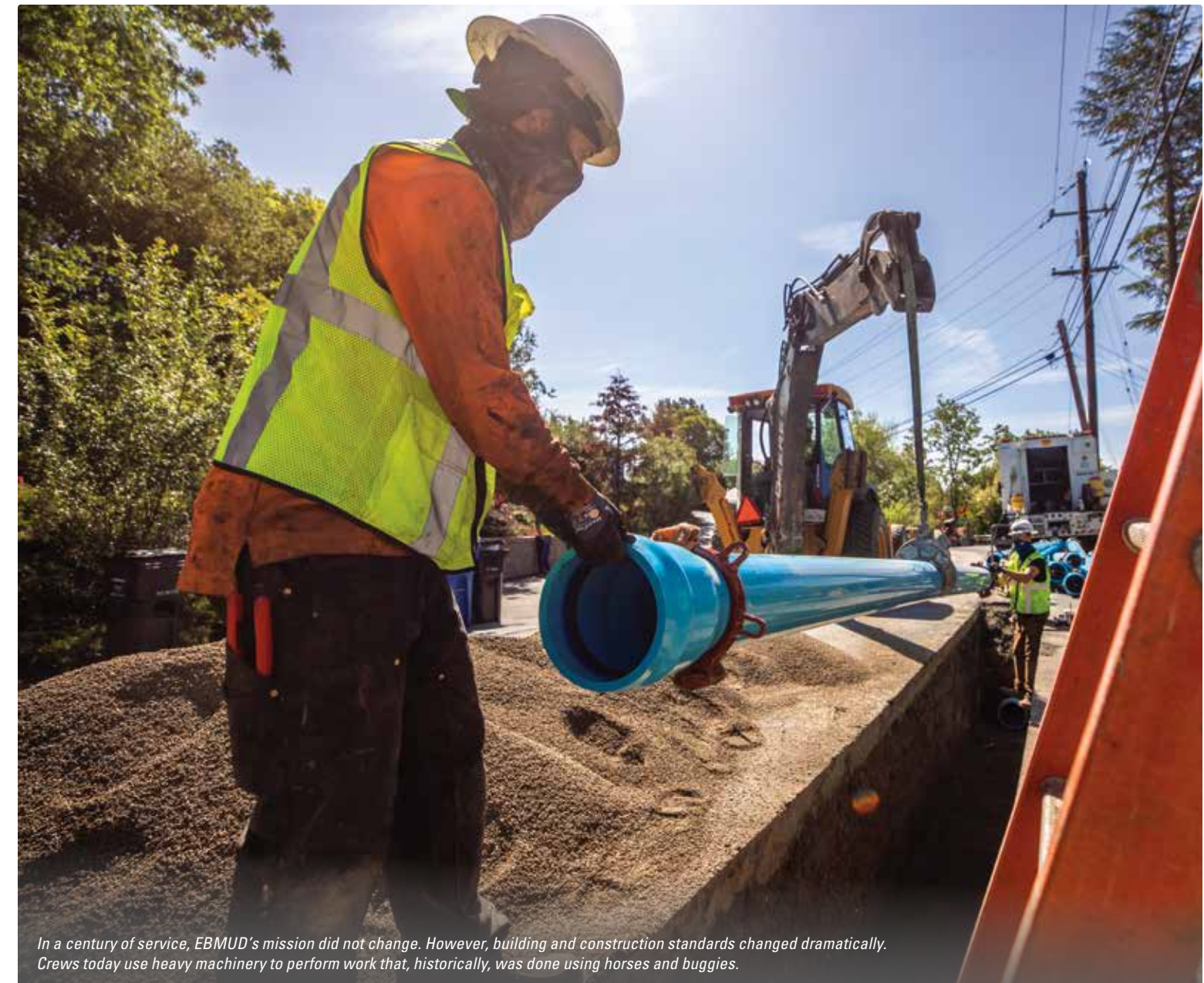
In a century of service, EBMUD's mission did not change. However, building and construction standards changed dramatically. Crews today use heavy machinery to perform work that, historically, was done using horses and buggies.