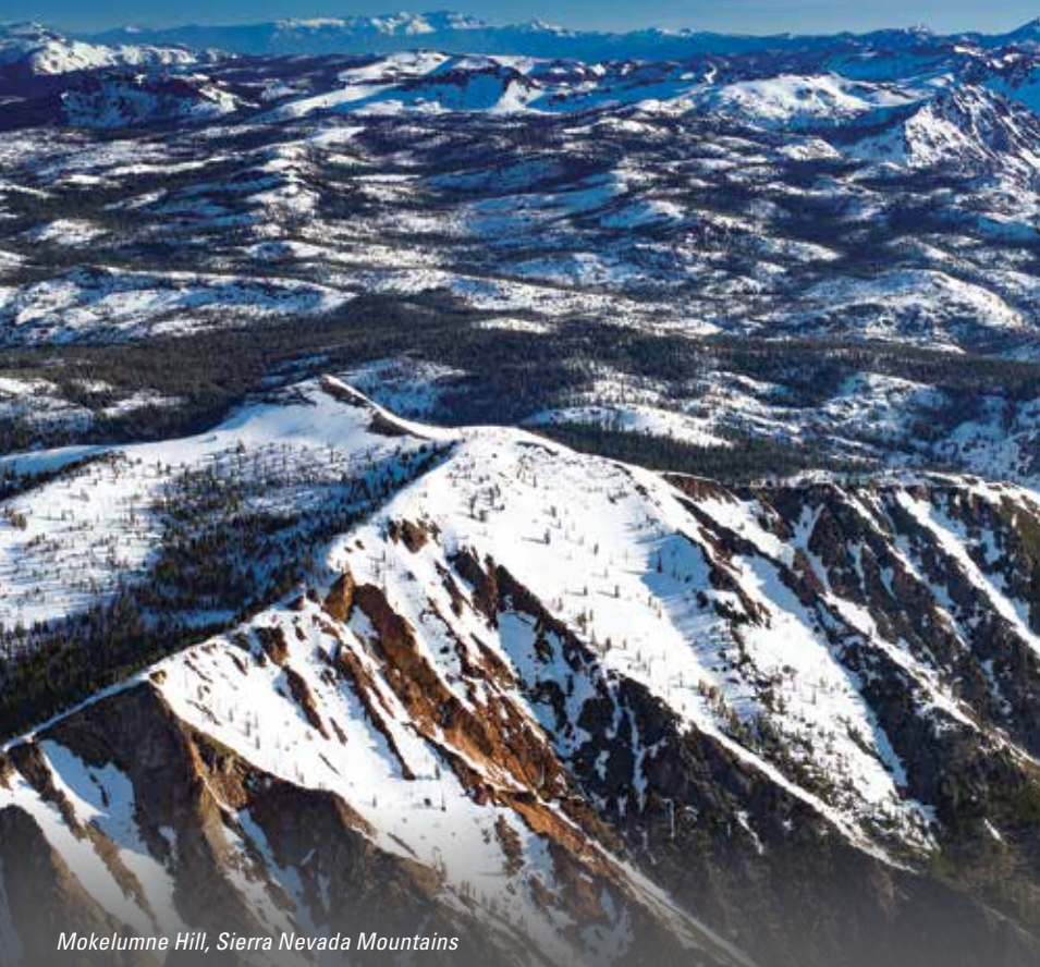
Mokelumne Hill, Sierra Nevada Mountains

375 Eleventh Street Oakland, CA 94607 1-866-403-2683 www.ebmud.com