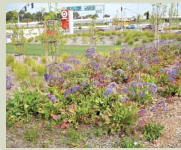
Above: Commercial site in Albany, mulched to control weeds and conserve soil moisture.

Left: Albany Buchanan Street medians were constructed using sheet mulch and other Bay-Friendly landscaping practices.