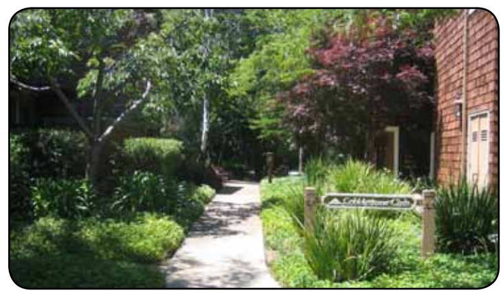
Well managed landscapes can save you water and money.

now carefully monitored and only the correct amount of water needed by this mature landscaping is applied. Serpico crews read their irrigation meters routinely to track consumption and check for leaks.