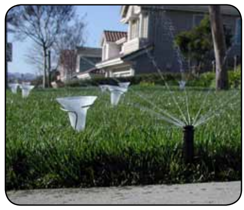
Irrigated Area: 18+ estimated acres of irrigated area.