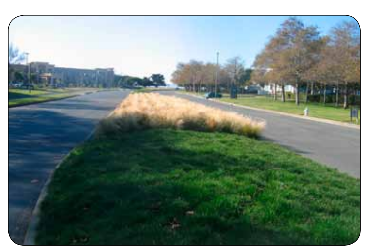
Drought-tolerant, climate-appropriate plants provided the finishing touch.