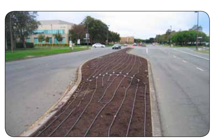
In-line drip irrigation was installed.