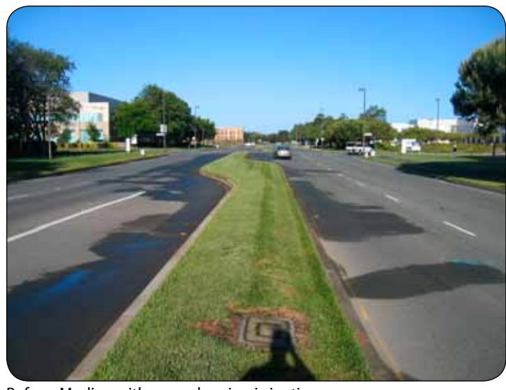
Before: Median with grass showing irrigation overspray.

A choice was made at the beginning of the project not to remove the existing lawn, but to use "sheet mulching" instead. Sheet mulching consists of placing layers of cardboard and mulch over the existing grass. The process nurtures the soil, suppresses weeds, and minimizes waste. Members of the surrounding community were invited to learn more and to watch sheet mulching in action.