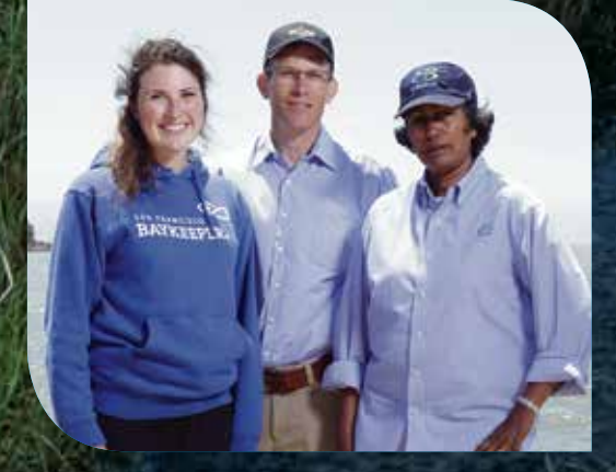
EBMUD works regularly with Baykeeper, Save the Bay and others to protect the San Francisco Bay.

Find out more about our work, see our insert in the September East Bay Express or online at ebmud.com/cleanbay.