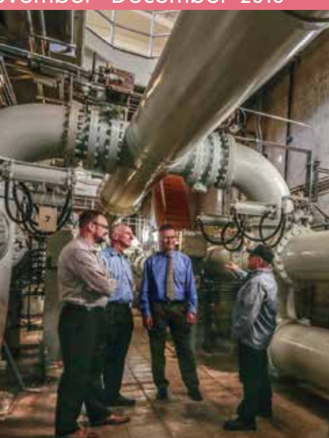
Engineering and Water Treatment experts discuss the $22 million upgrade to Orinda Water Treatment Plant, the heart of our water distribution system.

Although you'll never see it, these crucial improvements will provide flexibility to better operate the plant. Power, treatment and chemical systems, as well as process monitoring equipment will all be upgraded. This will allow us to split the plant in two to perform regular maintenance on half of the plant while the other half is still operating.