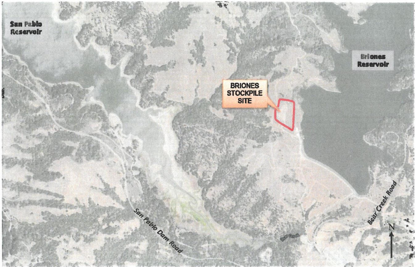
Figure 2 Briones Stockpile Site