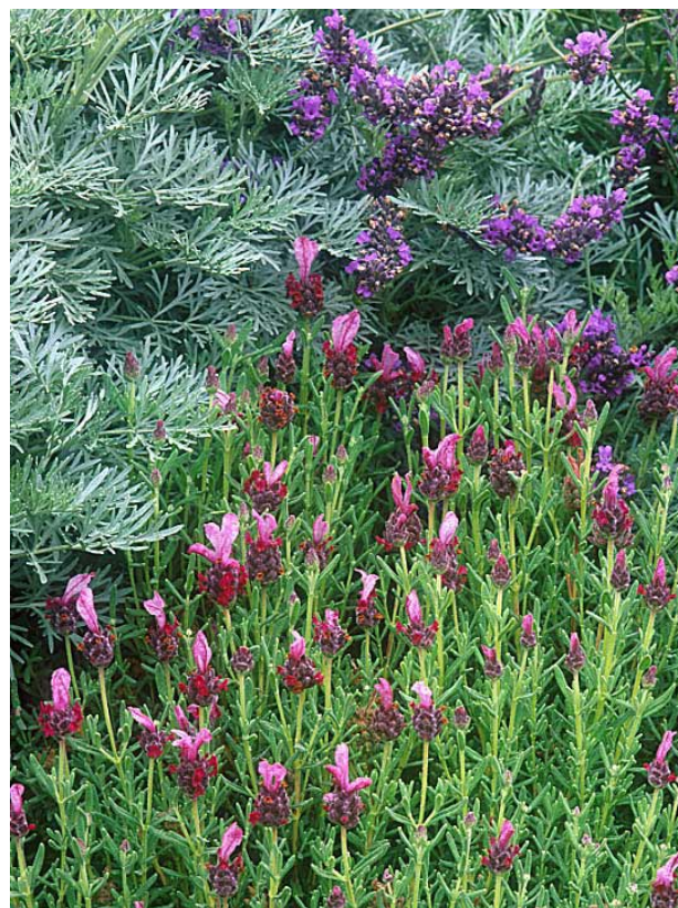
ARTEMISIA, NEPETA, AND FRENCH LAVENDER CREATE A COOL, LUSH LOOK WITH MINIMAL WATER USAGE.

Many plants are well suited to the Bay Region's climate and soils, and many garden styles can be adapted to express a regional landscape ethic. The English border or cottage garden can be reinterpreted using drought-tolerant native or mediterranean plants and gravel paths. A formal Italian- or French-inspired design might substitute